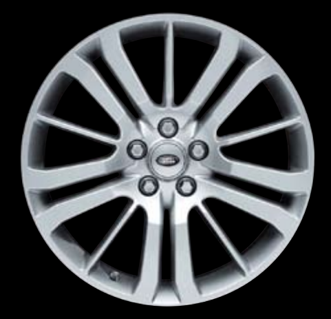
20-inch 9.5J 15-Spoke Alloy Wheel (Rim only) Sparkle Silver Finish — LR008548