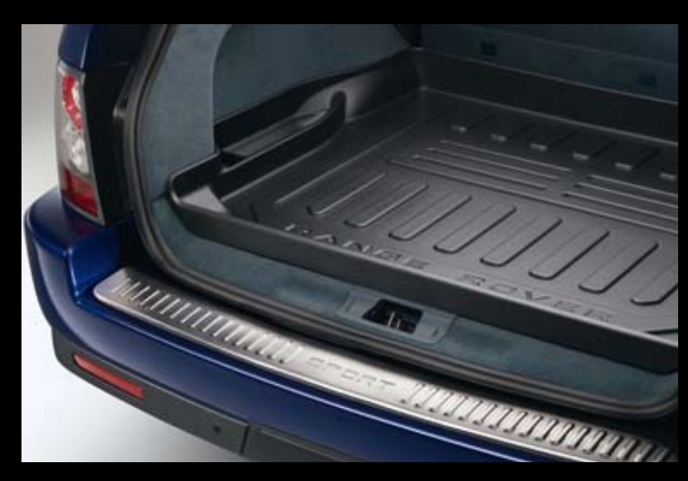
Rigid Loadspace Protector Non-slip surface. Not compatible with Cargo Divider or Cargo Barrier. EBF500020