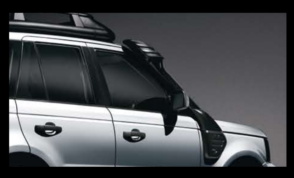
Raised Air Intake For 2005-09 vehicles only — ADL790020