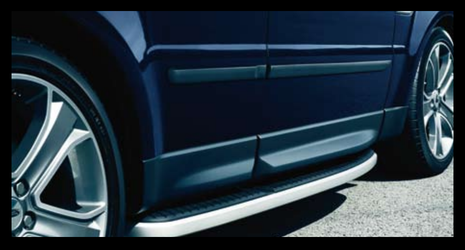
Body Side Moldings DGJ500020PCL

For 2010 vehicles onward (Upper) — VPLMB0041 (shown) For 2005-09 vehicles (Upper) — VUB503880MMM For 2005-09 vehicles (Lower) — LR003905