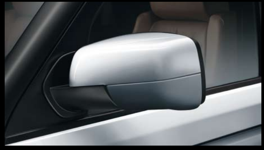
Body-Colored Mirror Kit (2005-09 vehicles only) Buckingham Blue — LR004863 Chawton White — LR004862 Java Black — LR004864 Rimini Red — LR004833 Santorini Black — VPLAB0011PAB Stornoway Grey — LR004837 Tonga Green — LR007531 Zermatt Silver (shown above) — LR004836 Primed (Upper) — LR004867 Primed (Lower) — LR004866