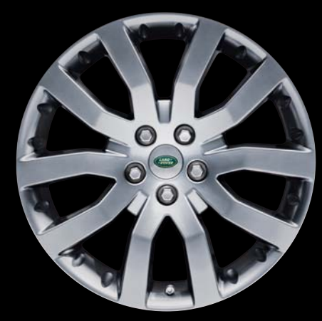
20-inch 9.5J 10-Spoke Alloy Wheel (Rim only) Shadow Chrome Finish — LR008742 Sparkle Silver Finish — RRC500681MNH Recommended Tires:

• Continental 4x4 Sport Contact 275/40/R20 106Y • Pirelli Scorpion Zero Asimmetrico 275/40/R20 Center Cap: