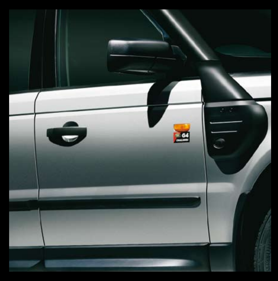
LR G4 Decal Kit Trumpet your sense of adventure with this unique LR G4 decal. HLD501083EMC