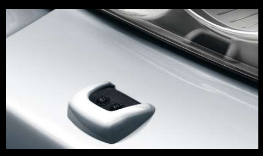
Washer Jet Cap (2005-09 vehicles only) Buckingham Blue — LR007921 Java Black — LR007916 Rimini Red — LR007919 Santorini Black — VPLAB0025PAB Stornoway Grey — LR007917 Tonga Green — LR007920 Zermatt Silver (shown above) — LR007918