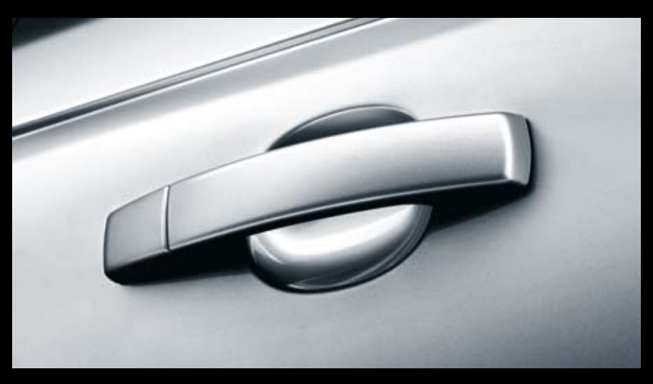
Body-Colored Door Handles (2005-09 vehicles only) Buckingham Blue — LR006944 Java Black — LR006949 Rimini Red — LR006942 Santorini Black — VPLAB0010PAB Stornoway Grey — LR006945 Tonga Green — LR006943 Zermatt Silver (shown above) — LR006946