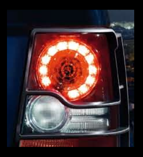
Rear Lamp Guards For 2010 vehicles onward — VPLSP0011