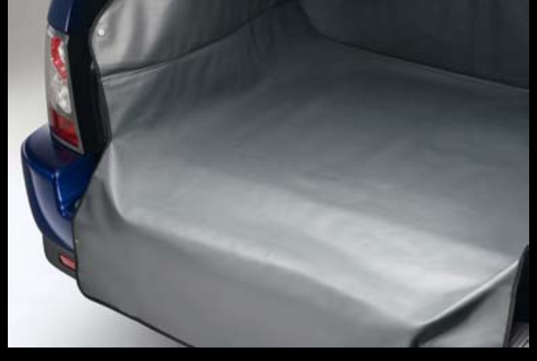
Flexible Loadspace Protector Heavy-duty fabric protects loadspace up to window height. Covers full loadspace, even with rear seats folded. Includes general purpose gloves. VPLSS0016