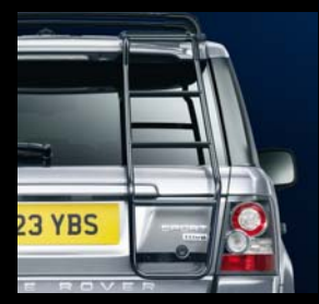
Rear Ladder AGP790020

For vehicles with Roof Rails. Fitting Kit (VUB504230) is required. Load capacity: 119 lbs. CAB5000130PMA