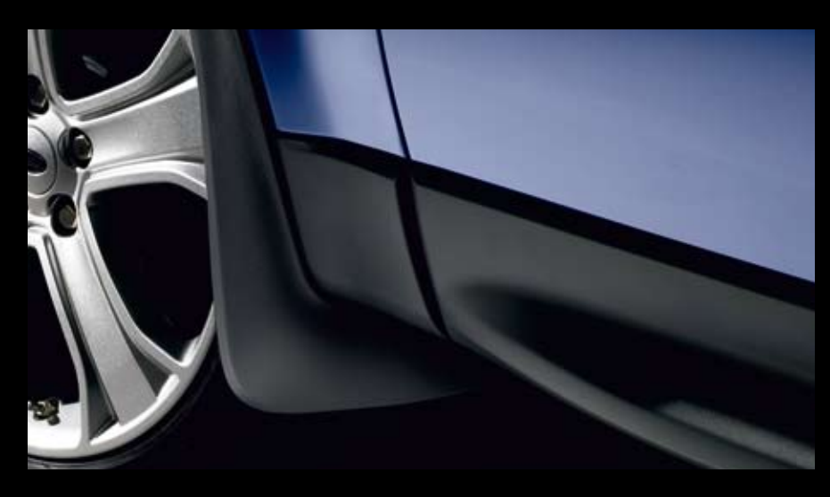
Front Mudflaps CAS500070PCL