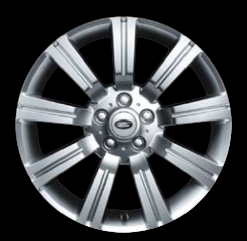
20-inch 9.5J Stormer Alloy Wheel (Rim only) Titan Silver Finish — RRC503820MCM

Nothing quite sets your Range Rover Sport apart like a stylish set of alloy wheels. Choose from several distinctive designs.