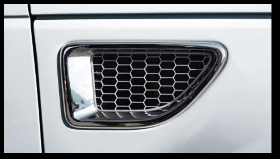
Chrome Fender Vent (Pair) For 2005-09 vehicles only — LR006304