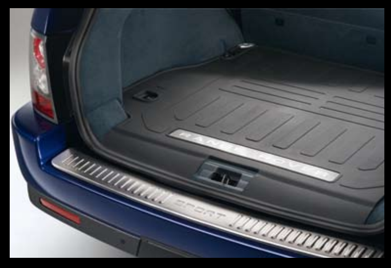
Loadspace Rubber Mat Waterproof with retaining lip and non-slip surface. EAH500090PMA