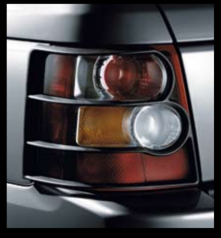
Rear Lamp Guards For 2005-09 vehicles — VUB501920