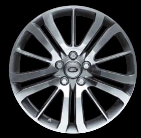
20-inch 9.5J 15-Spoke Alloy Wheel (Rim only) Diamond Turned Finish — LR008549