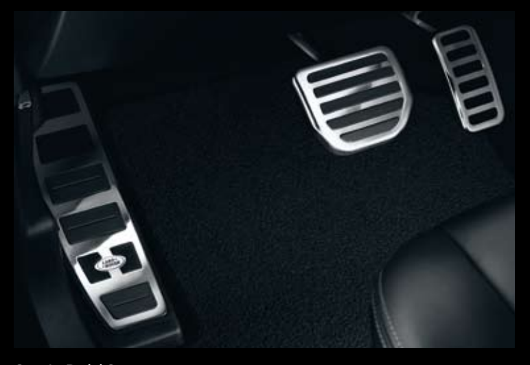
Sports Pedal Covers Bright Finish covers enhance existing footrest and pedal covers. For 2005-09 vehicles only — LR008713

Provides protection to the upper surface of the rear bumper. LR007321 — Compatible with all models except vehicles fitted with a Stormer Pack. LR007322 (not shown) — Compatible with 05MY-09MY Stormer Pack only.