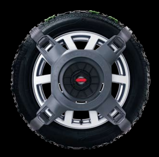
Snow Traction System For front 17", 18", 19" and 20" wheels. LR005737