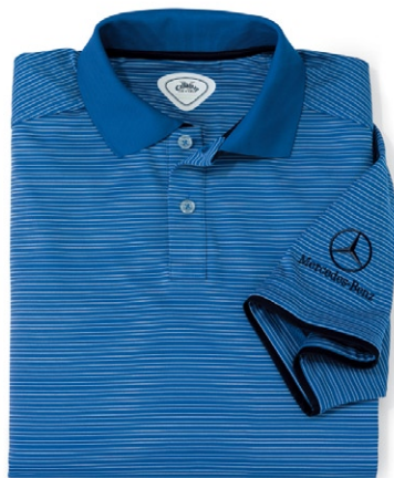
12. MEN'S CALLAWAY GOLF – DRY SPORT PERFORMANCE STRIPE POLO 2-button placket with contrast-tipping on sleeves. Callaway Golf silicone patch on right sleeve and Mercedes-Benz logo on left arm. Available in sizes S-2X. A962 999 0142 $83.00