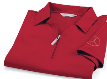
13. WOMEN'S CALLAWAY GOLF – DRY SPORT STRETCH PERFORMANCE POLO Tech fit, short sleeve, half-zip polo with Callaway logo on zipper and Mercedes-Benz logo on left arm. Available in sizes S-XL. A962 999 0141 – Red $73.00