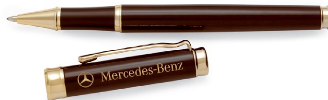
8. PRECISION ROLLER BALL PEN Chesnut roller ball pen with brass cap and barrel. Includes standard European black roller ball ink cartridge. A962 999 0185 $22.00