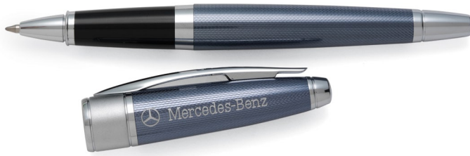
6. CROSS® APOGEE PEN Polished chrome selectip rolling ball pen with pale blue translucent lacquer. A962 999 0186 $130.00