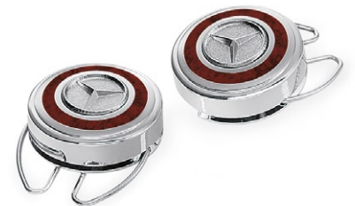
6. BUTTON COVERS Designed to cover buttons, offering the look of cufflinks. Raised logo surrounded in Burl Wood finish. B6 695 4017 $33.00