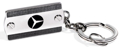
6. FIBER TEXTURE KEY RING Carbon fiber-like material with logo on center band. A962 999 0128 $18.00