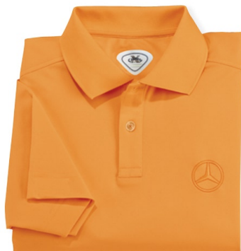
11. MEN'S CALLAWAY GOLF – DRY SPORT PERFORMANCE SOLID POLO 2-button placket with solid knit color. Mercedes-Benz logo on left chest. Available in sizes S-2X. A962 999 0139 – Apricot $73.00