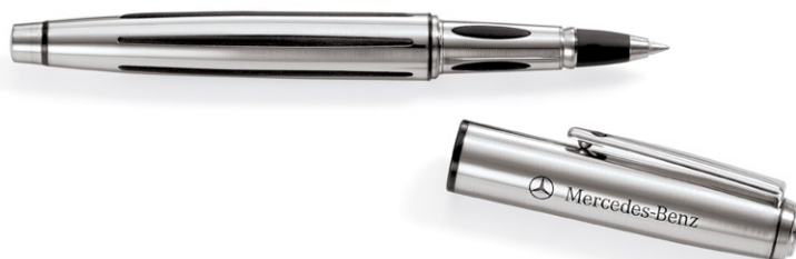
9. GRIP PEN Silver pen with rubber grips. Pull-off cap. Logo located on cap. A962 999 0074 $25.00