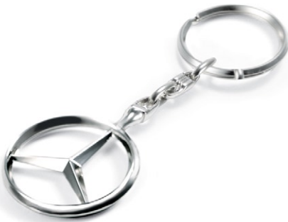
4. BRUSSELS KEY RING Lustrous metal Mercedes-Benz star. B6 606 4005 $10.00