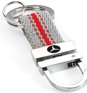
2. RED AND GREY NYLON KEY RING Nylon strap with logo on bottom band. U-shaped opening mechanism. A962 999 0127 $15.00