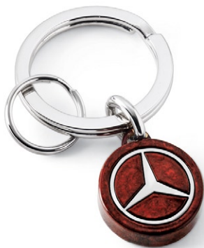
15. SLIDER KEY RING Burl Wood & polished silver medallion A962 999 0174 $18.00