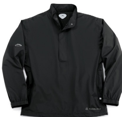
15. MEN'S CALLAWAY GOLF – RAIN SPORT PULLOVER Long sleeve, half-zip pullover with Velcro cuffs and drawstring waist cord. Callaway Golf logo on right arm and Mercedes-Benz logo on lower left of jacket front. Available in sizes S-2X. A962 999 0143 $158.00