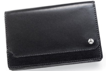
3. BUSINESS CARD CASE Leather credit card/business card case. Two slots to fit multiple cards. MB logo rivet on front. B6 695 6484 $30.00