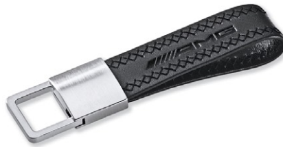
20. AMG LEATHER KEY RING Black key ring with embossed AMG logo on the front. Silver metal closure. B6 603 7327 $42.00