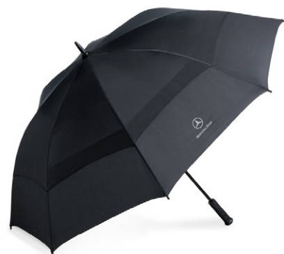
16. GOLF UMBRELLA Double-canopy construction. Wind resistant. Sturdy fiberglass frame and shaft, ergonomically designed pro-grip handle. Patented auto-open pinchless runner system. Logo on umbrella and handle. Diameter (open) 62". A961 999 5479 $40.00