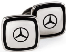
4. CUSHION CUFF LINKS Silver square cushion-cut cuff links with black enamel trim and logo. 16mm. A962 999 0134 $22.00