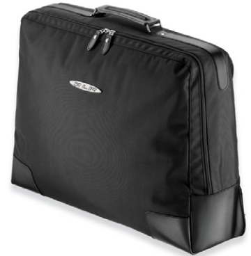
3. SLR WEEKEND TASCHE/DUFFLE BAG 100% textured nylon with carbon-look lining and leather handle. Approx. 24" x 17" x 6" B6 695 7257 $120.00