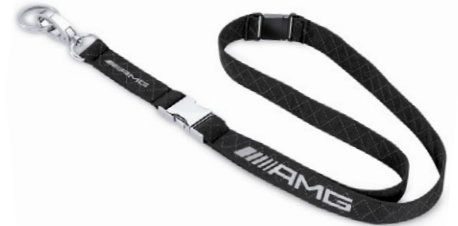
21. AMG LANYARD Lanyard in anthracite. Silver-colored snap hook, split ring for keys and click lock. Safety clasp at back of neck. AMG logo in silver rubber. 100% polyester. B6 603 7334 $20.00