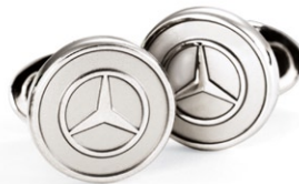
5. ROUND CUFF LINKS Silver round cuff links with raised logo. A962 999 0135 $22.00