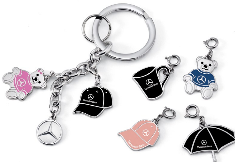
16. CHARM KEY RING Struck brass charms with ground enamel finish and Mercedes-Benz medallion. A962 999 0175 – Charm Ring $18.53 A962 999 0202 – Black Coffee Mug A962 999 0203 – Pink Cap A962 999 0204 – Black Cap A962 999 0205 – Umbrella