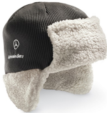
10. WINTER CAP Grey with off-white lining. 100% cotton. Lining 65% polyester and 35% acrylic. B6 787 6790 $25.00