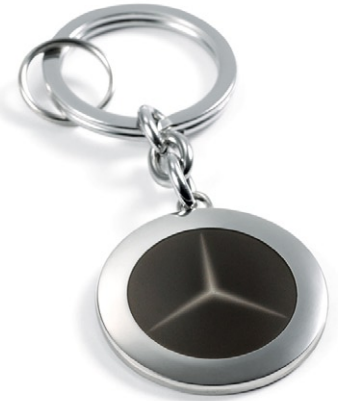
3. GLASS KEY RING Mercedes-Benz star embedded in black glass. A961 999 5470 $18.00