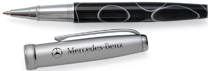
7. VENUS ROLLER BALL PEN Black acrylic roller ball pen with artistic white design. Includes standard European black roller ball ink cartridge. A962999 0184 $20.00