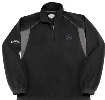
14. MEN'S CALLAWAY GOLF – WINDSHIRT Long sleeve microfiber half-zip windshirt with contrast stripe. Callaway Golf logo on right sleeve and Mercedes-Benz logo on left chest. Available in sizes S-2X. A962 999 0144 $136.00