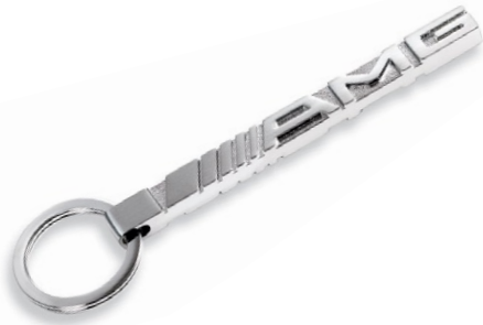
19. AMG KEY RING Metal with embossed AMG logo. B6 695 7154 $35.00