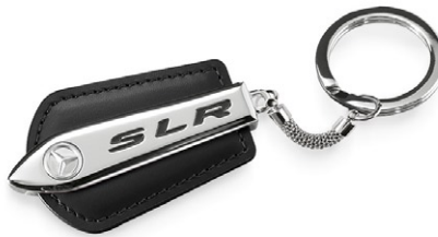
2. SLR KEY RING III Silver brass with black leather. Embossed with SLR and 3D star logo. High quality rhodium finish. B6 695 7256 $50.00