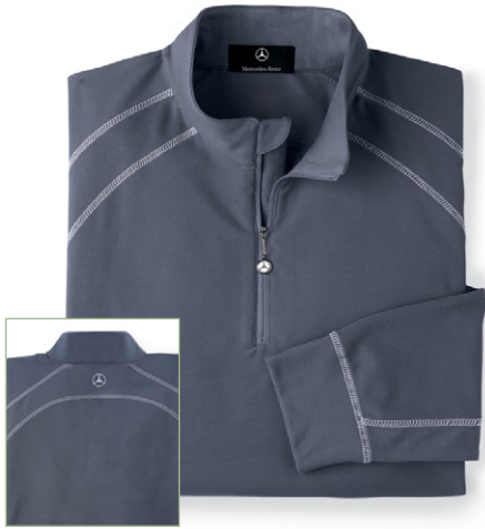
7. MEN'S WAFFLE KNIT 1/4 ZIP PULLOVER 100% polyester moisture management waffle knit pullover with contrasting triple needle coverstich and custom Mercedes zipper pull. Lower back hidden zip pocket. Available in sizes S-3X. A962 999 0178 $61.25