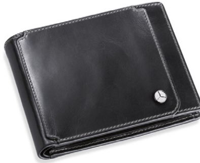
2. MEN'S WALLET Leather wallet with eight slots for credit cards and 5 additional items. MB logo debossed on inside and rivet on outside. Also has compartment for change. B6 695 6483 $90.00