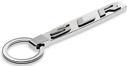
I. SLR BAUREIHEN KEY RING Silver colored diecast brass with high-quality rhodium finish. B6 695 7254 $40.00