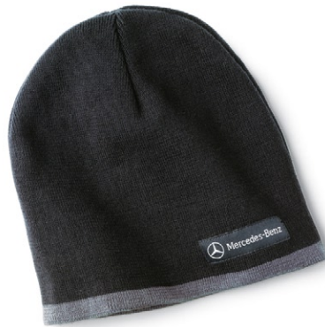
11. CUSTOM KNIT CAP 8" narrow beanie, regular gauge knit 100% acrylic, stretch to fit, one size fits most. Embroidered Mercedes-Benz logo on front. A962 999 0157 $18.00