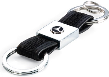
1. BLACK NYLON DOUBLE KEY RING Black nylon strap valet with raised logo on center band. A962 999 0126 $18.00