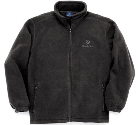
9. MEN'S FLEECE JACKET Plush, pill-proof, 100% microfilament polyester. Two front side pockets, full zip front, with custom Mercedes-Benz rubber zipper pull. Logo embroidered on left chest. Available in sizes S-3X. A962 999 0112 $60.00