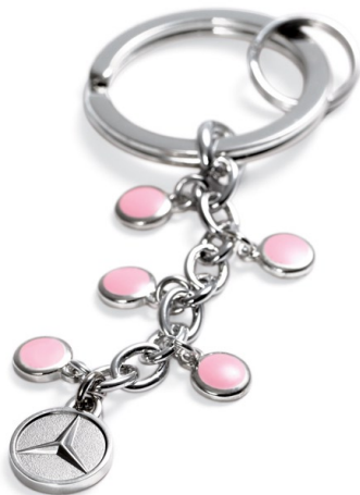
13. PINK MULTI-CHARM KEY RING Decorative chain with pink charms and logo. A961 999 2620 $18.00