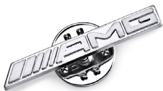
22. AMG PIN Silver-colored metal pin with AMG logo. B6 603 7328 $15.00