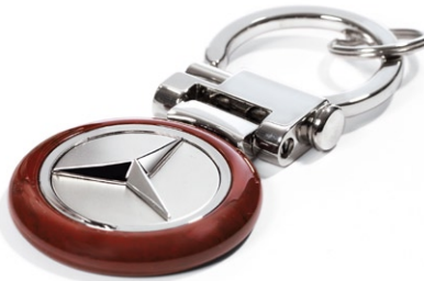
5. BURL WOOD KEY RING Stylish Burl Wood finish. Spring mechanism for easy attachment and removal of keys. A950 999 3109 $25.00