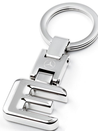
14. VEHICLE BADGE KEY RINGS Chrome-covered brass replica of vehicle badging. B6 695 7502 – C-Class B6 695 7503 – E-Class B6 695 7504 – G-Class B6 695 7505 – R-Class B6 695 7506 – S-Class B6 695 7507 – CL-Class B6 695 7508 – GL-Class