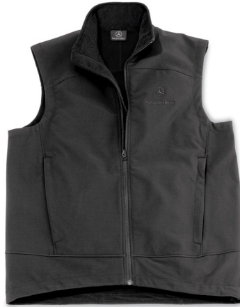
8. MEN'S SOFT SHELL VEST 100% polyester stretch woven shell, with 100% polyester microfleece lining. Four-way stretch for easy movement, full zip front, front zippered pockets and open hem bottom. Logo embroidered on left chest. Available in sizes S-3X. A962 999 0108 $45.00