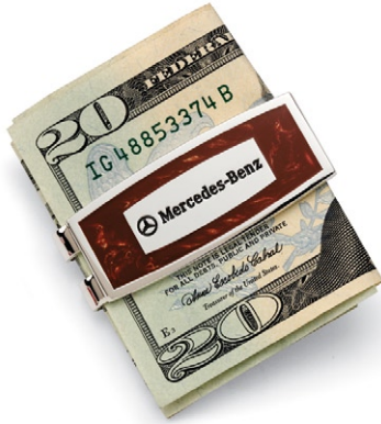
1. BURL WOOD MONEY CLIP Struck brass money clip with ground enamel Burl Wood finish. A962 999 0173 $18.00