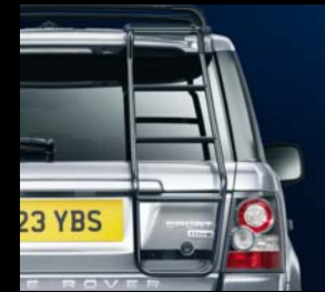
Rear Ladder AGP790020

For vehicles with Roof Rails. Fitting Kit (VUB504230) is required. Load capacity: 119 lbs. CAB5000130PMA