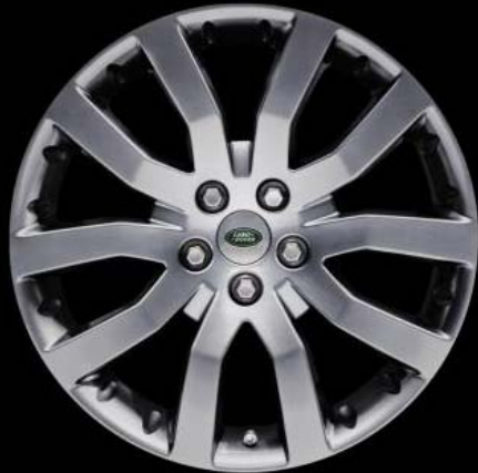
20-inch 9.5J 10-Spoke Alloy Wheel (Rim only)