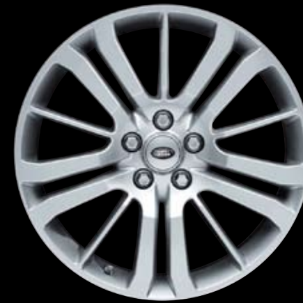
20-inch 9.5J 15-Spoke Alloy Wheel (Rim only) Sparkle Silver Finish — LR008548