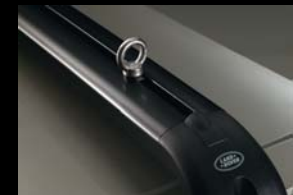
Lashing Eye Kit Six additional tie-down points for use with T-slots on Crossbars. VUB503160

*Roof Rails and Crossbars are required for all Land Rover roof-mounted accessories. Objects placed above the roof-mounted satellite antenna may reduce the quality of the signal received by the vehicle and could have a detrimental effect on the navigation and satellite radio systems, if fitted.