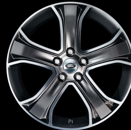
20-inch 9.5J 5-Spoke Alloy Wheel (Rim only)