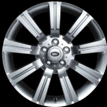
20-inch 9.5J Stormer Alloy Wheel (Rim only) Titan Silver Finish — RRC503820MCM

Nothing quite sets your Range Rover Sport apart like a stylish set of alloy wheels. Choose from several distinctive designs.