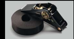
Ratchet Strap Secure items to the Luggage Carrier, Crossbars or Expedition Roof Rack with a Ratchet Strap. CAR500010