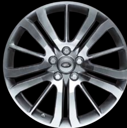
20-inch 9.5J 15-Spoke Alloy Wheel (Rim only) Diamond Turned Finish — LR008549