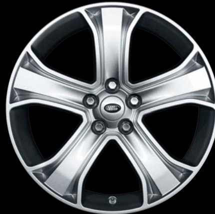
20-inch 9.5J 5-Spoke Alloy Wheel (Rim only)

The alloy wheel designs are the same for both part numbers. However, LR008742 has a Shadow Chrome Finish and RRC500681MNH has a Sparkle Silver Finish. Both fit 2010MY and pre-2010MY vehicles.