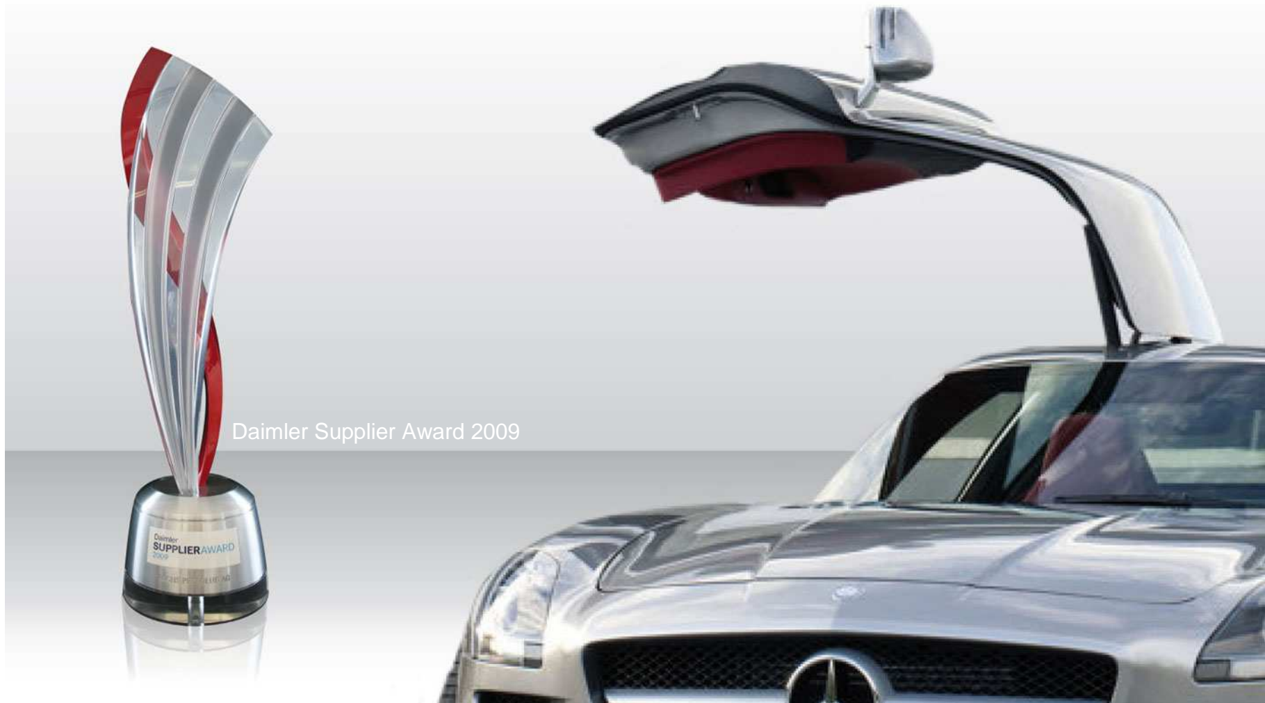
Daimler Supplier Award 2009